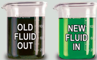
The C-VAC 3 Coolant Service Machine's flush process replaces virtually 100% of engine's coolant.