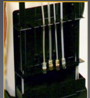
Adapter organizer with removable drip tray