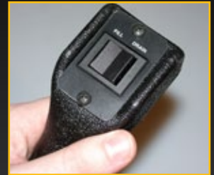
Fingertip control pendant allows faster operation.