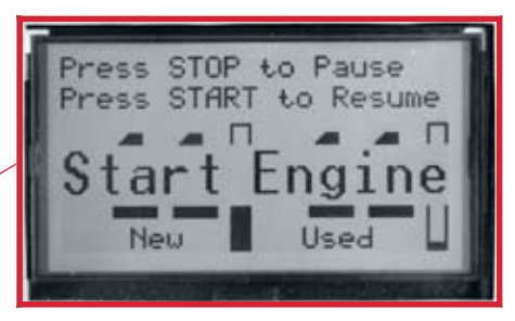
Easy to follow prompts