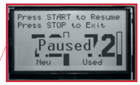
Ability to stop during service